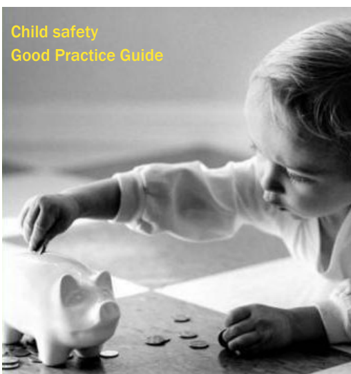
Child safety Good Practice Guide

(integrated in the new EuroSafe website but still accessible with the former web address)