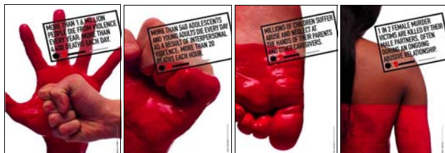
Violence 1.8 Young people and violence 2.8 Child abuse and neglect 3.8 Intimate partner violence 4.8