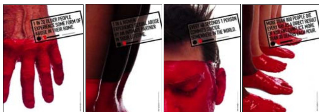
Elder abuse 5.8 Sexual violence 6.8 Self-directed violence 7.8 Collective violence 8.8