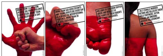
Violence 1.8 Young people and violence 2.8 Child abuse and neglect 3.8 Intimate partner violence 4.8