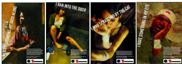
Elder abuse 5.8 Sexual violence 6.8 Self-directed violence 7.8 Collective violence 8.8

To date, both sets of posters have been distributed to WHO Regional and Country offices, and ministries of health, WHO collaborating centres and NGOs have been invited to request copies. The posters – free of charge and