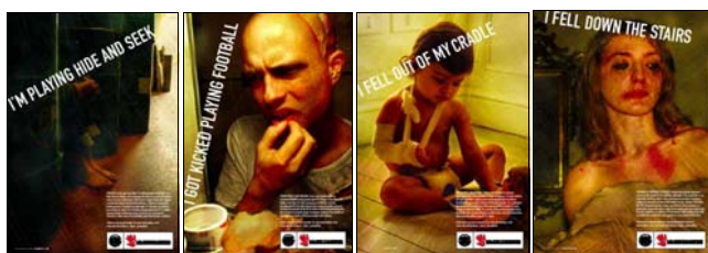
Violence 1.8 Young people and violence 2.8 Child abuse and neglect 3.8 Intimate partner violence 4.8