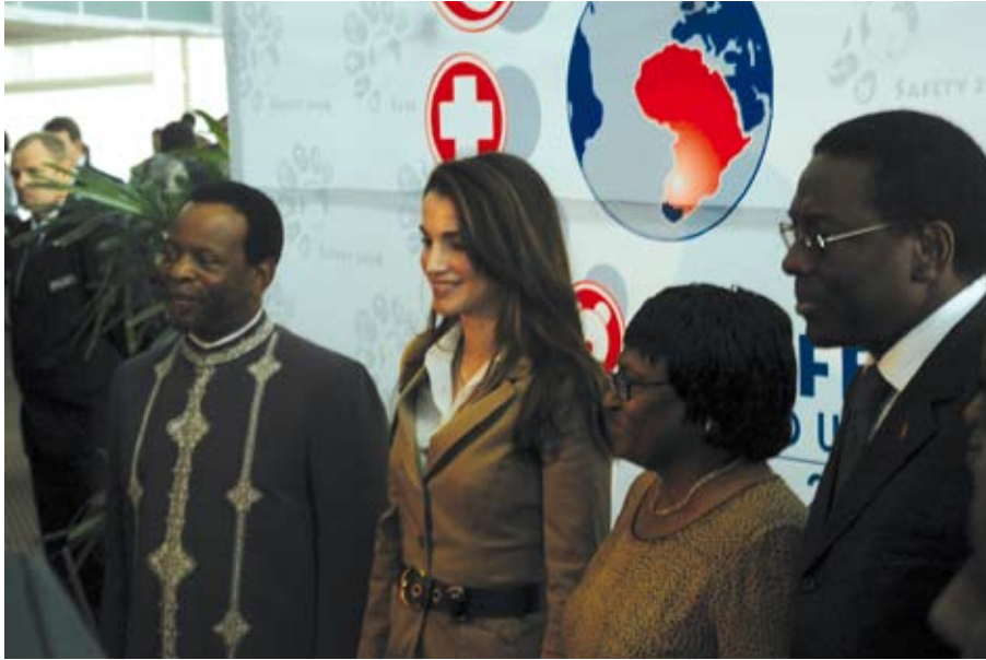
8th World Conference on Injury Prevention and Safety Promotion's special guests at the opening ceremony. From left to right: His Majesty King Goodwill Zwelithini kaBhekuzulu of KwaZulu; Her Majesty Queen Rania Al-Abdullah of Jordan; the Minister of Health of South Africa, the Honourable Dr M E Tshabalala-Msimang and the Director of the WHO Regional Office for Africa, Dr Luis Sambo

enforcement, to contain and manage individuals who mar the lives of others by engaging in violent behaviour.